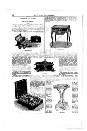
Engravings of the objects in Tahan's stand at the 1855 World's Fair,