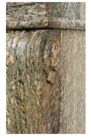
Detail of pink and green Campan