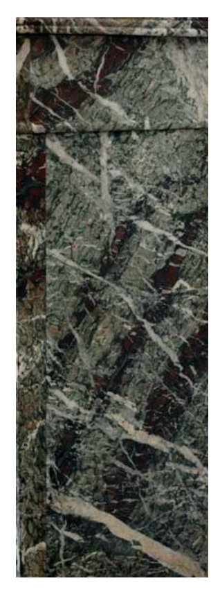
Detail of Campan Petit Mélange