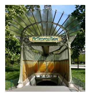
Hector Guimard, aedicula for the subway station, « Dauphine » stop