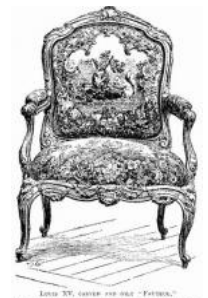
LOUIS XV. CHAIR, 1754 - FATHON. Engraved with the artist's name. Taken from La France's Edition.