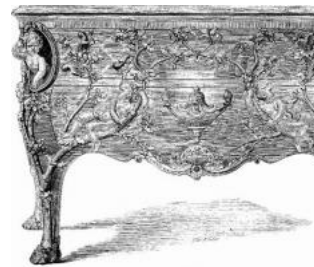
CHAMBRE In Perspective, with various Minutiae of the Room, painted by Louis Boucher in the presence of the King. Engraved by Cochin. Paris, 1754.