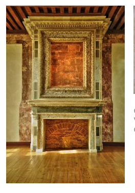
Grand Trianon, Palace of Versailles, columns made out of Campan grand mélange marble