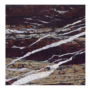
Campan grand mélange marble