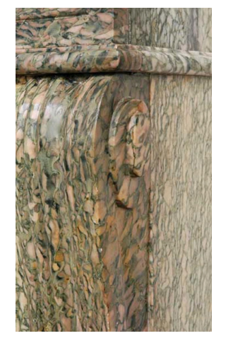
Pink and green Campan marble