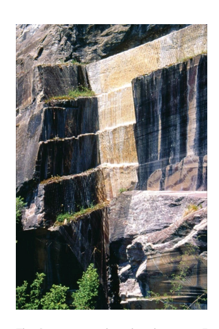
The Campan quarries, place known as Espiadet in Hautes-Pyrénées department, 20th century quarry face