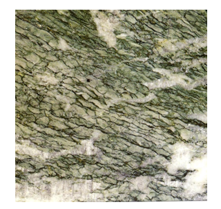
Green Campan marble