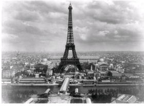
View on the Eiffel Tower during the World Fair of 1889..