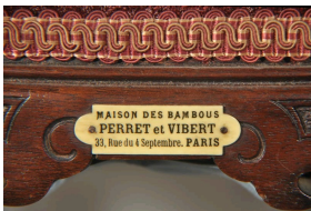
Plate put on a furniture on which we can read Maison des Bambous.

In 1900 Perret and Vibert once again exhibited their work at the Universal Exhibition of Paris, under the category of “luxury and cheap furniture”. They were rewarded with a silver medal for their “high quality lacquered and marquetry furniture”.