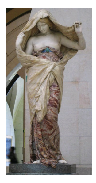
Sculpture by Barrias, Orsay Museum, Paris.