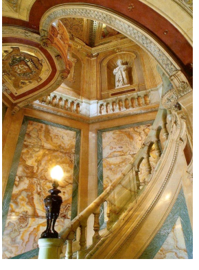
The staircase made out of onyx in the Hotel de Païva in Paris.