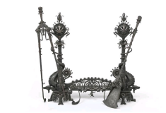
Neo-Gothic andirons, made by Eugène Grasset in cast iron, c. 1880-1885. Paris, Museum of Decorative Arts.