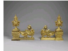
Pair of andirons with winged lions, realized in 1784 by Pierre-Philippe Thomire for Louis XV's daughters in the Castle of Bellevue. Louvre Museum.