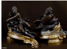
Louis XV style two-patinas andirons, c. 1750.