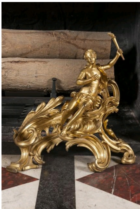
Andiron with Pluto, in the King's Cabinet. Gilt bronze, Louis XV style, Versailles Palace.

Rather than being designed in pairs, the andirons are sometimes mounted on a bar , which will often be used from the Empire. The nineteenth century largely reused the vocabularies of the eighteenth century, calling on the great sculptors of the time like Carrier-Belleuse or Feuchère , and great bronze makers like the Barbedienne Foundry. But the firedogs, with their medieval name, also awaken the amateurs of the Neo-Gothic style. Thus, in the 19th century, many wrought iron andirons were built, inspired by the Middle Ages, with more or less fantasy. Eugène Grasset's end-of-the-century andirons kept in the Museum of Decorative Arts in Paris contribute to accentuate the mysterious charm that the space of the fireplace can have.