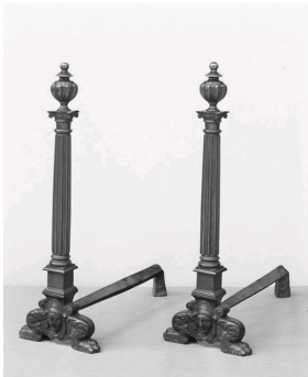
Pair of andirons, late 17th century. Attributed to Jean-Antoine Ducerceau. Metropolitan Museum, New-York.

The Louis XVI style still uses these animals in complementary couples , such as the famous deer and wild boar andirons of Madame du Barry , designed by Quentin-Claude Pitoin in 1772. These animals, however, rest on symmetrical and ordered pedestals that characterize the andirons of the new trend adopted by Marie-Antoinette . Often decorated with vases and garlands, the andirons of the time revisit the forms of antiquity and also adopt sphinxes and chimeras . The models of Charles De La Fosse and the achievements of Pitoin and Pierre-Philippe Thomire dominate the period.