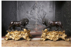
Louis XV style two-patinas andirons with lions, c. 1750, Versailles Palace.

Jacques Cafféri, "The Hen" and "The Rooster", gilt bronze andirons, 1735. Paris, Museum of Decorative Arts.