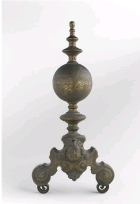
Brass andiron, 17th century. National museum of Renaissance, Castle of Ecouen.

In the Renaissance they began to be made of bronze , which is lighter than iron. The Renaissance andiron is usually topped with a ball . Then, in the classical age, the bourgeoisie and the aristocracy of the seventeenth century were systematically equipped with andirons, often in copper . The decorative interest of the andirons developed under Louis XIII, where we see the appearance of silver andirons ordered by Cardinal Mazarin . Versailles Palace thus counted under Louis XIV some forty pair of silver firedogs, but they were melted to fuel the war effort of the Sun King.