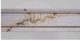
Fireplace in Paonazzo marble, Marc Maison Gallery.