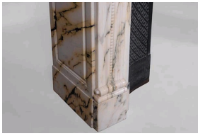
Fireplace in Paonazzo marble, Marc Maison Gallery.