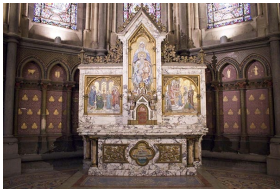
Altar of Saint Ann Chapel, Notre-Dame of Treilles, Lille, France.