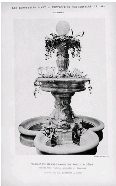
Vase in Paonazzo marble, Parnofy and Huve, 1889 World's Fair in Paris.