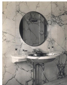
Bathroom in Paonazzo marble in the Pavilion of the Collectionneur, by Ruhlmann, at the 1925 Paris International Exhibition of Decorative Arts, Library of Decorative Arts, Maciet Album.