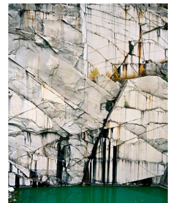
Quarry of Paonazzo marble, Tuscany, Italy.

The Paonazzo marble takes its name from its dark veins encircled with a halo where the mauve and the yellow recall the color of peacock feathers. Extracted from the quarries of Carrara and Calacatta marble in Tuscany , it was used in the Antiquity to build the Corinthian columns of the Hadrian Mausoleum .