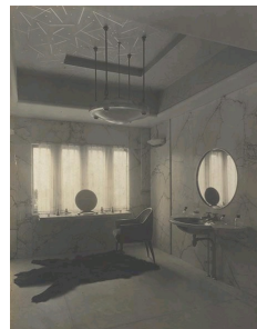
Bathroom in Paonazzo marble in the Pavilion of the Collectionneur, by Ruhlmann, at the 1925 Paris International Exhibition of Decorative Arts, Album of the Pavilion of the Collectionneur by J.E. Ruhlmann.