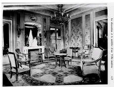
Livingroom for a villa by Louis Sorel, with a fireplace in Paonazzo, Art et Decoration, 1910.