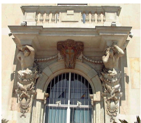
Atlantes by Pierre Puget in Toulon, 1657.