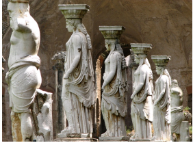
Caryatids in the Hadrian Villa in Tivoli, 2nd century.