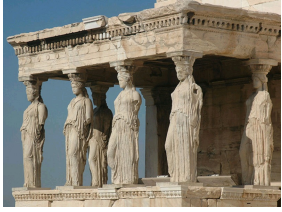
The famous caryatids of the Erechtheion on the Acropole in Athens.

A caryatid is a statue of a woman generally dressed in a long toga used to support an entablature in place of a column, a pillar or a pilaster. The Greek name "Karyatides" meant inhabitant of Karyae, a town in Laconia. The inhabitants of this town are said to have sided with Persia in the Greco-Persian wars. The Greeks punished the people of Karyae for this treachery by enslaving the women and making them carry heavy loads.