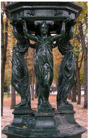
Wallace Fountain with caryatids, 19th century.