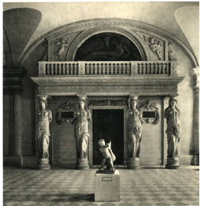
Caryatids by Jean Goujon, 1550, Louvre Museum, Paris.