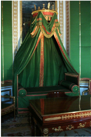
Bedroom of emperor Napoleon I, Fontainebleau.

120, rue des rosiers 93400 Saint Ouen (France) tel: +33.(0)6.60.62.61.90 contact@marcmaison.com