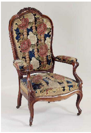
Voltaire armchair with wheels, covered with petit point tapestry, backrest surmounted by carved flowers, rosewood, metal, musée national Magnin, Dijon.