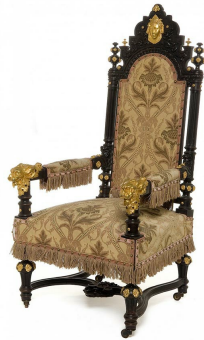
Ringuet Père et Fils, Armchair, c. 1839, Blackened pearwood, bronze, Detail, A bedroom under Louis-Philippe, 1836-1840, Les Arts Décoratifs, Paris.