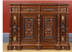
Grohe brothers, Writing desk commode, circa 1839, Rosewood, ebony, palm tree, marble, Musée du Louvre, Paris.