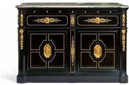
Louis-Alexandre Bellangé (1797 - 1861), Writing desk commode, c. 1839-1843, Ebony and blackened pearwood, mahogany, gilt bronze, gray marble, leather, Les Arts Décoratifs, Paris.