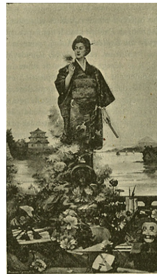
Picture 15 : Decorative panel, by Louise Abbéma (1853-1927).