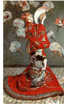
Picture 10 : Claude Monet, The Japanese Lady, 1876, Museum of fine Arts, Boston