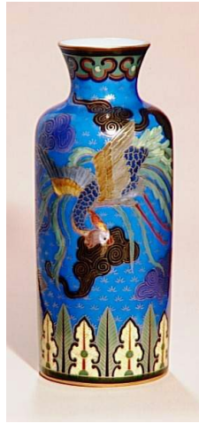
Picture 8 : Vase, Escalier de Cristal, circa 1880. Orsay Museum, Paris.