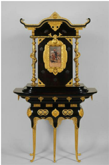
Picture 6 : Two bodies cabinet, Édouard Lièvre, 1877. Orsay Museum, Paris.