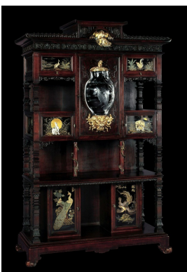
Picture 5 : Display Cabinet by Gabriel Viardot, circa 1895, Corning Museum of Glass, United States.

“When I said that Japonisme was in the process of revolutionizing the vision of the European peoples, I meant that Japonisme brought to Europe a new sense of color, a new decorative system, and, if you prefer, a poetic imagination” (Edmond de Goncourt, Journal , April 1884)