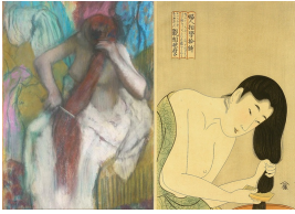
Picture 1 : Edgar Degas, Woman combing hair, 1900 ; Kitagawa Utamaro, Bijin combing hair, 1801