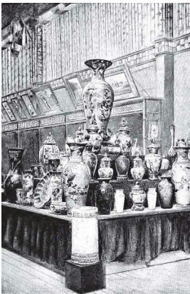
Picture 4 : Japanese ceramics in the Japan Pavilion, World's Fair of 1889 in Paris.