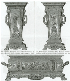
Picture 12 : World's Fair of 1878, Paris, the Blot & Drouard Company presented these two Japanese style vases and planter.