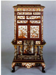
Picture 7 : Cabinet, Ferdinand Duvinage, circa 1880. Orsay Museum, Paris.